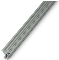
Holding profile, snaps into the cover holder APK-TU, with groove for Zack strip ZB 5 to ZB 10, length: 2 m

Please be informed that the data shown in this PDF document is generated from our online catalog. Please find the complete data in the user documentation. Our general terms of use for downloads are valid.