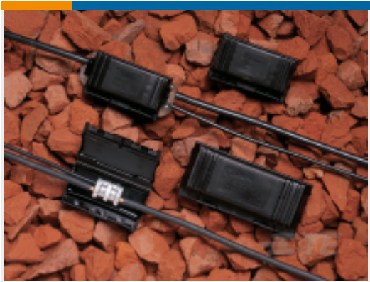
TE Part # 629995-000 GHFC-3-90(B18)