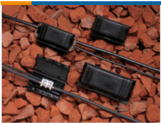
TE Part # 505941-000 GHFC-3-90(B6)