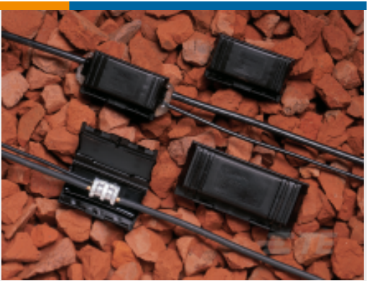
TE Part # 348333-000 GHFC-2-90(B100)