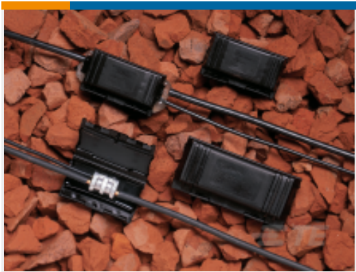
TE Part # 765669-000 GHFC-1-90(B10)

This information is provided based on reasonable inquiry of our suppliers and represents our current actual knowledge based on the information they provided. This information is subject to change. The part numbers that TE has identified as EU RoHS compliant have a maximum concentration of 0.1% by weight in homogenous materials for lead, hexavalent chromium, mercury, PBB, PBDE, DBP, BBP, DEHP, DIBP, and 0.01% for cadmium, or qualify for an exemption to these limits as defined in the Annexes of Directive 2011/65/EU (RoHS2). Finished electrical and electronic equipment products will be CE marked as required by Directive 2011/65/EU. Components may not be CE marked. Additionally, the part numbers that TE has identified as EU ELV compliant have a maximum concentration of 0.1% by weight in homogenous materials for lead, hexavalent chromium, and mercury, and 0.01% for cadmium, or qualify for an exemption to these limits as defined in the Annexes of Directive 2000/53/EC (ELV). Regarding the REACH Regulation, the information TE provides on SVHC in articles for this part number is based on the latest European Chemicals Agency (ECHA) 'Guidance on requirements for substances in articles' posted at this URL: https://echa.europa.eu/guidance-documents/guidance-on-reach