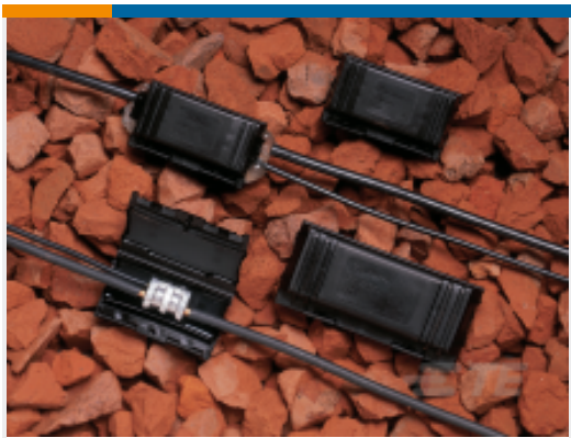
TE Part # 166533-000 GHFC-1-90(B100)