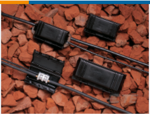
TE Part # C48562-000 GHFC-2.5-90(B300)