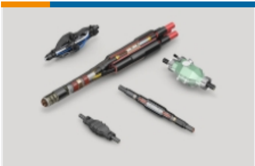
Joints & Splices(7)