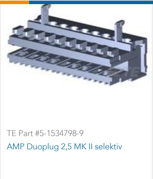
TE Part #5-1534798-9 AMP Duoplug 2,5 MK II selektiv