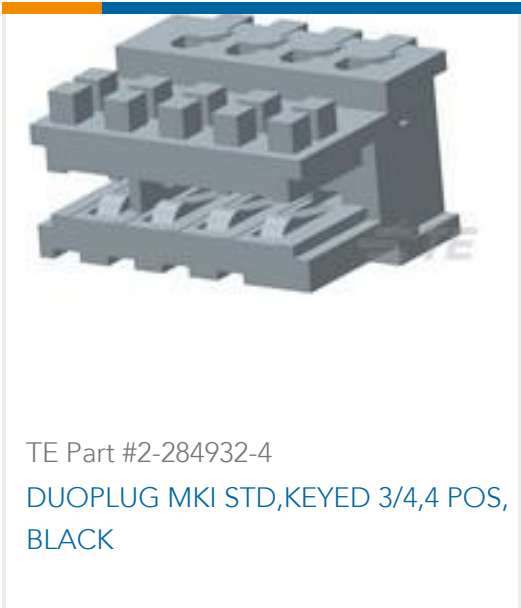
TE Part #2-284932-4 DUOPLUG MKI STD,KEYED 3/4,4 POS, BLACK

Product Drawings DUOPLUG2,5GEH 8P 6X English