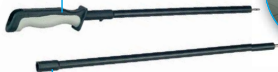
Connecting test probe by standard socket.