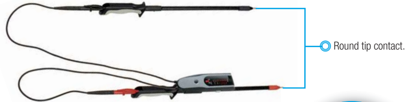
Round tip contact.

Delivered in storage bag 50 x 150 x 470 mm.