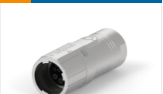
TE Part #BSA601N0086127A000 917 plug, speedtec

ENG_CVM_CVM_BGC863N0000152A000_A.2d_dxf.zip