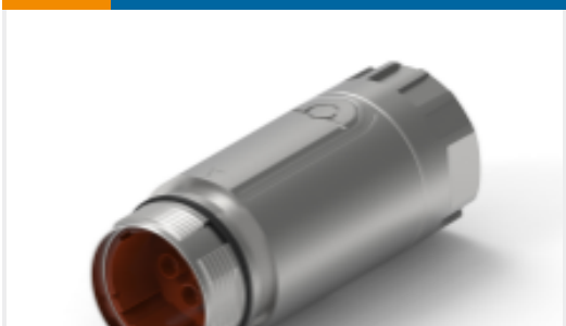
TE Part #CKA267N00450051000 940 EXTENSION, SPEEDTEC-READY