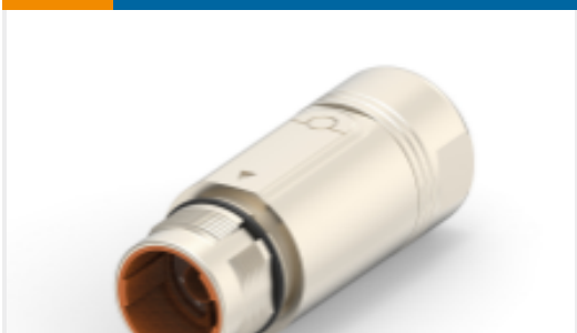
TE Part #BKA186N00480200000 923 EXTENSION, SPEEDTEC-READY