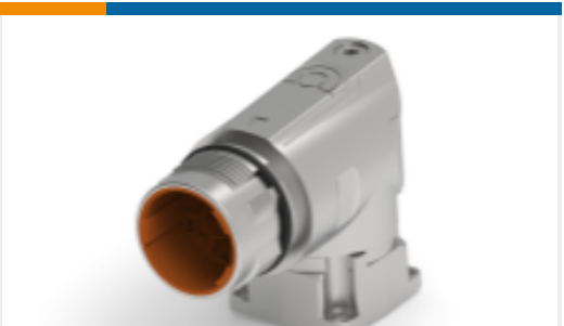
TE Part #BGC106N00001216000 923 RECEPTACLE, ANGLED, ROTATABLE