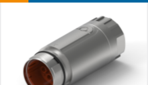
TE Part #CKA268N00440051000 940 EXTENSION, SPEEDTEC-READY