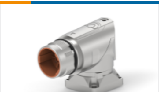
TE Part #BGC106N00001200000 923 RECEPTACLE, ANGLED, ROTATABLE