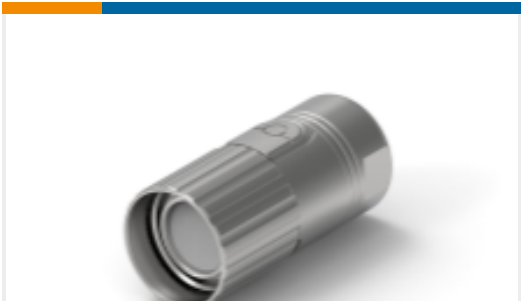
TE Part #ASA000N00390235000 623 PLUG