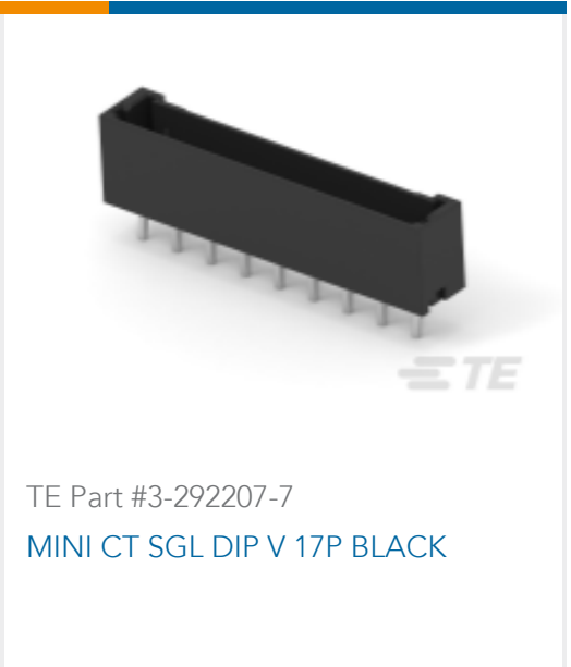
TE Part #3-292207-7 MINI CT SGL DIP V 17P BLACK