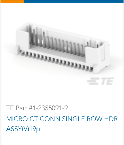
TE Part #1-2355091-9 MICRO CT CONN SINGLE ROW HDR ASSY(V)19p