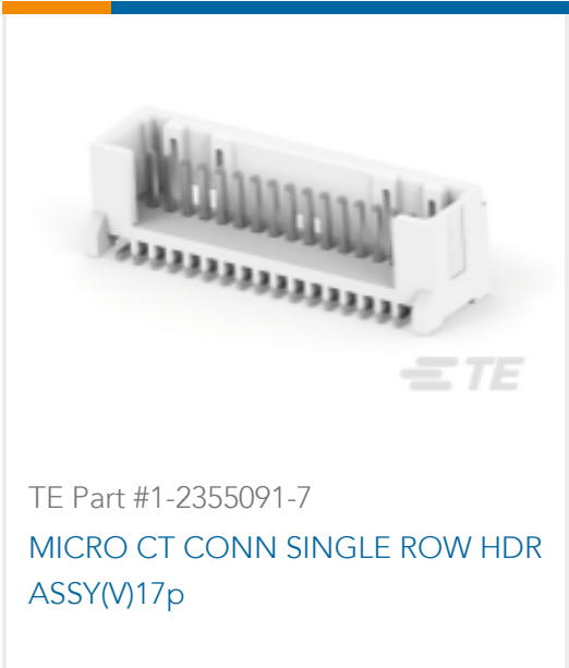
TE Part #1-2355091-7 MICRO CT CONN SINGLE ROW HDR ASSY(V)17p