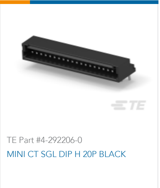
TE Part #4-292206-0 MINI CT SGL DIP H 20P BLACK