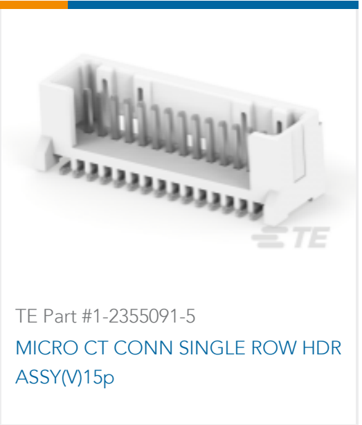
TE Part #1-2355091-5 MICRO CT CONN SINGLE ROW HDR ASSY(V)15p