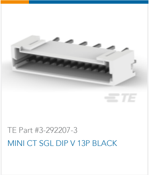
TE Part #3-292207-3 MINI CT SGL DIP V 13P BLACK