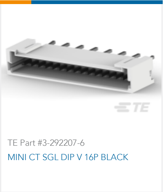
TE Part #3-292207-6 MINI CT SGL DIP V 16P BLACK