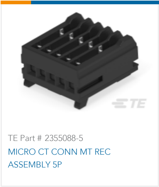
TE Part # 2355088-5 MICRO CT CONN MT REC ASSEMBLY 5P