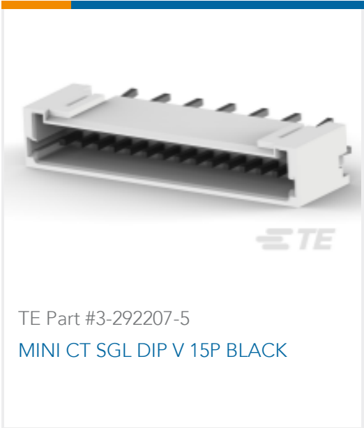
TE Part #3-292207-5 MINI CT SGL DIP V 15P BLACK