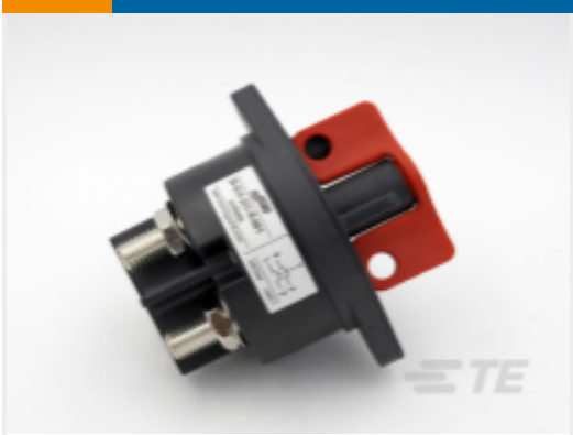
TE Part #K1159655 Battery Disconnecter, 500A, 2 Pole