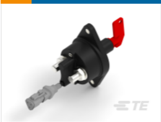
TE Part #K1138460 Battery Disconnecter, 500A, 1 Pole