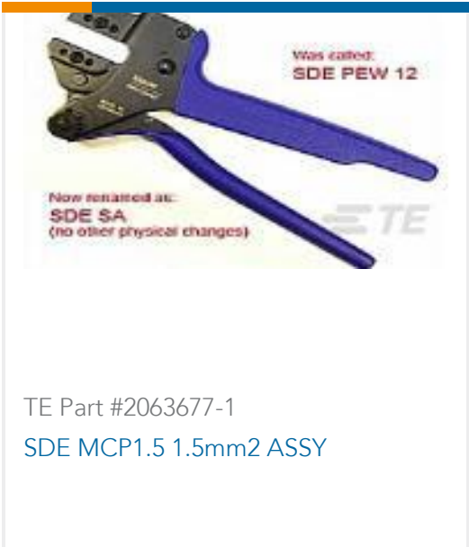
TE Part #2063677-1 SDE MCP1.5 1.5mm2 ASSY