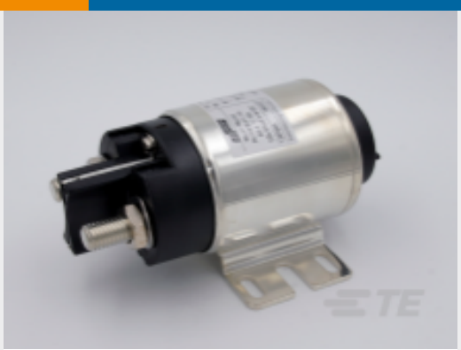
TE Part #K1131955 RELAY 500A 24V S-FL LK 29-511-12A