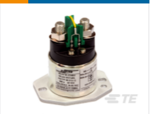
TE Part #K1006083 Relay 30-313-12