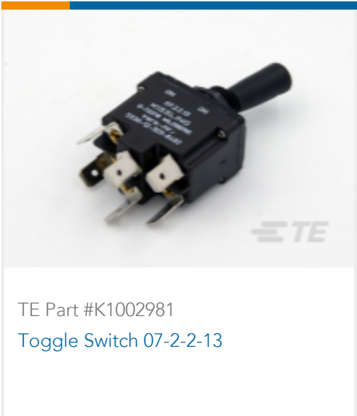
TE Part #K1002981 Toggle Switch 07-2-2-13