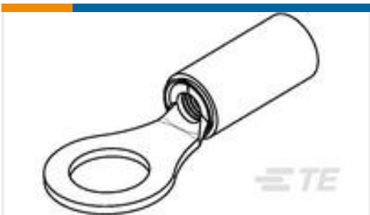
TE Part #1577649-1 TERMINAL RT PIDG PEEK STRATO 10 AWG