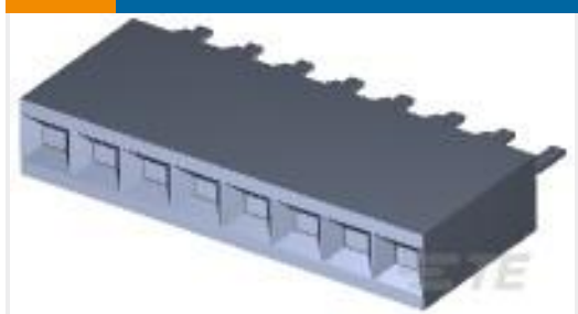
TE Part #534237-6 08 MODII VRT SR CE 100/115