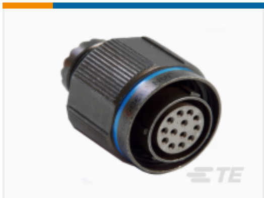
TE Part #YDTS26W21-41SBV001 PLUG ASSY