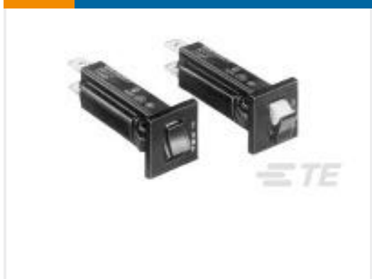
TE Part #3-1393250-4 W28-XQ1A-3=W28-