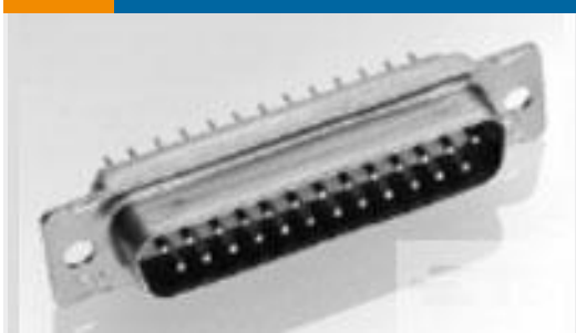
TE Part #1757823-9 AMPLIMITE,ASY,PLUG,STD,90,ZN,3,CT