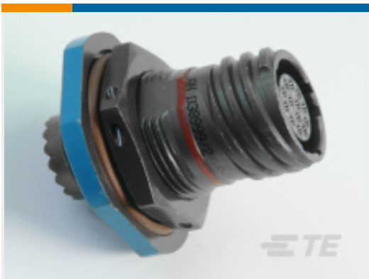
TE Part #YDTS24W17-35SAV001 RECP ASSY