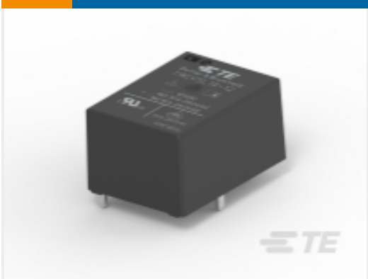
TE Part #1558667-7 T9GS2L14-24