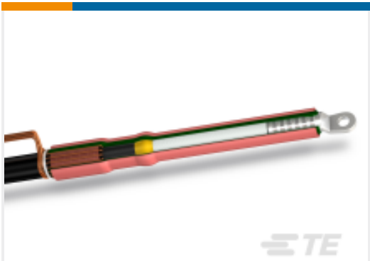
TE Part #433828-000 Heat Shrink Terminations: 1C/3C, Indoor