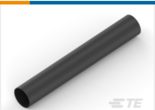
TE Part #NB11644001 ATUM-6/2-0-SP