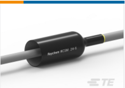
TE Part #CU9291-000 WCSM-24/6-1200/S