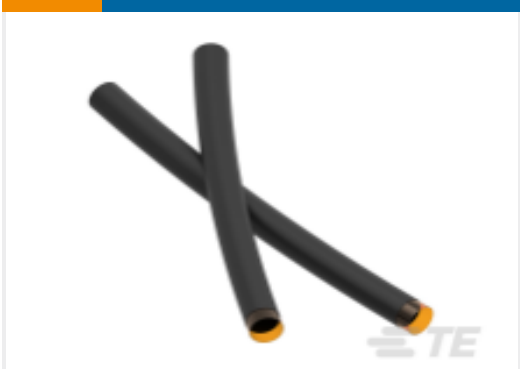
TE Part #NB13892001 TAT-125 Heat Shrink Tubing