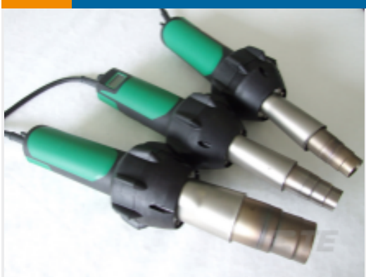
TE Part # EG1114-000 CV1981-ST-230V1600W-EU

as defined in the Annexes of Directive 2000/53/EC (ELV). Regarding the REACH Regulation, the information TE provides on SVHC in articles for this part number is based on the latest European Chemicals Agency (ECHA) 'Guidance on requirements for substances in articles' posted at this URL: https://echa.europa.eu/guidance-documents/guidance-on-reach