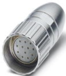
Cable connector, straight, shielded: yes, Screw locking, M23, cable diameter range: 3 mm ... 10.5 mm

Please be informed that the data shown in this PDF Document is generated from our Online Catalog. Please find the complete data in the user's documentation. Our General Terms of Use for Downloads are valid ( http://phoenixcontact.com/download )