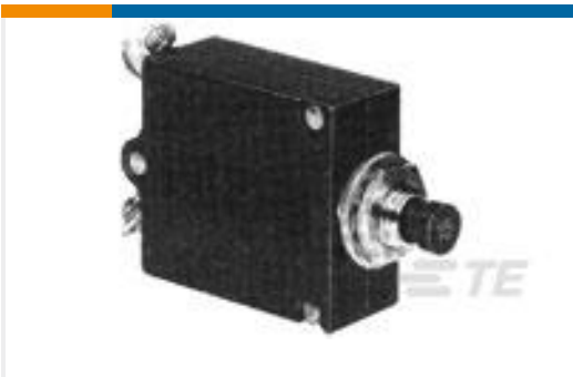
TE Part #6-1393246-7 W23-X1A1G-2=W23/W31