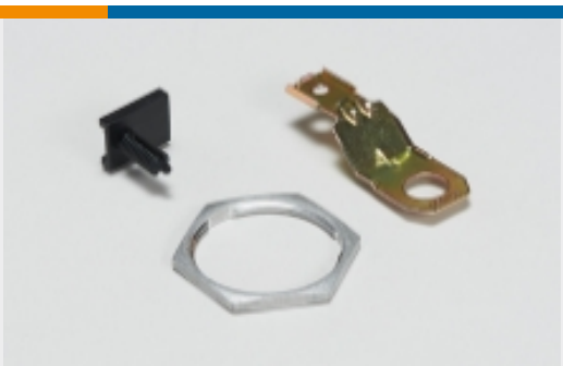
Other Automotive Connector Accessories(2)