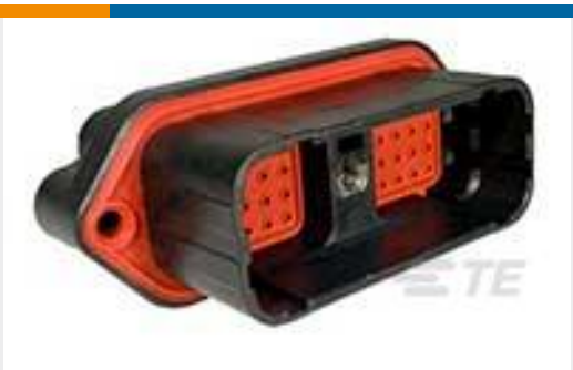
TE Part #DRC22-40PA 40P RECP ASM