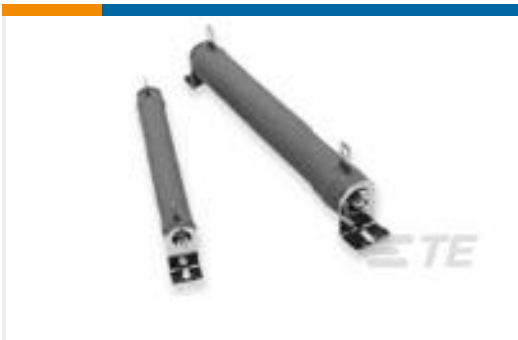
TE Part #1879451-5 TE 600W 2R2 5% Bracket