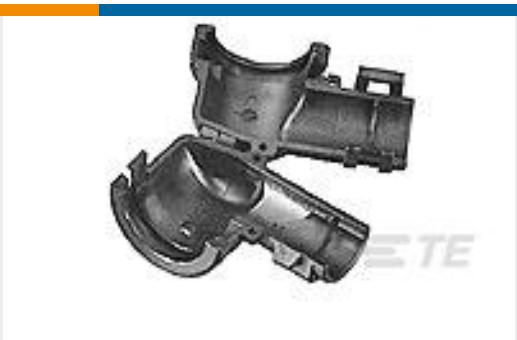
TE Part #965783-1 ABDECKKAPPE 90GRD