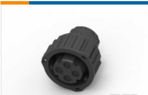
TE Part #1-967325-1 2,5MM BU-GEH 4P