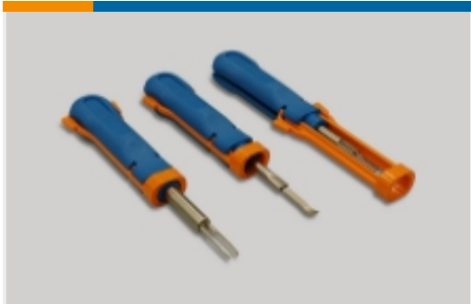
Insertion & Extraction Tools(8)