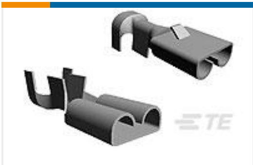
TE Part #5-160526-9 FF 250 REC 0.5-1.5MM2 TPPB