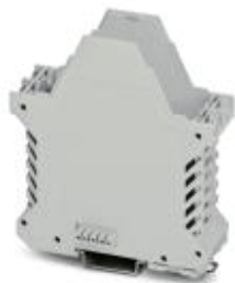
Component housing, length: 99 mm, color: light gray

Please be informed that the data shown in this PDF Document is generated from our Online Catalog. Please find the complete data in the user's documentation. Our General Terms of Use for Downloads are valid ( http://phoenixcontact.com/download )