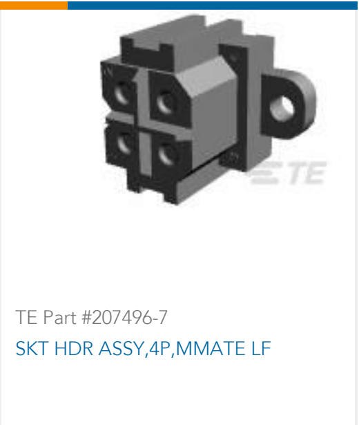
TE Part #207496-7 SKT HDR ASSY,4P,MMATE LF