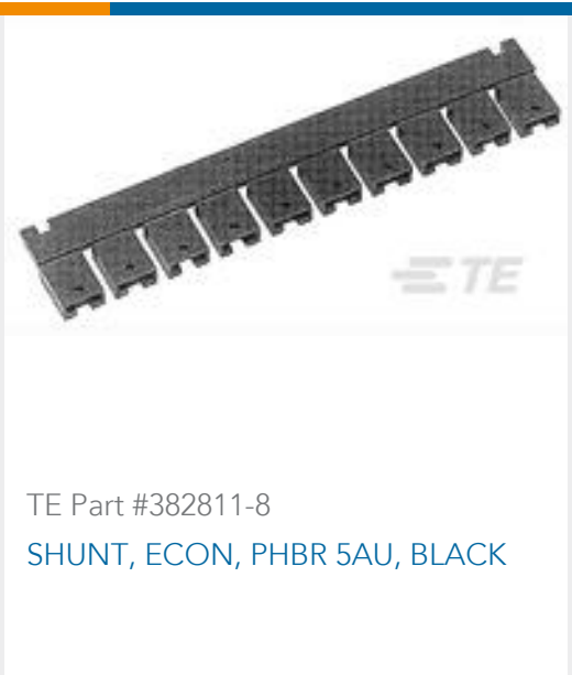
TE Part #382811-8 SHUNT, ECON, PHBR 5AU, BLACK