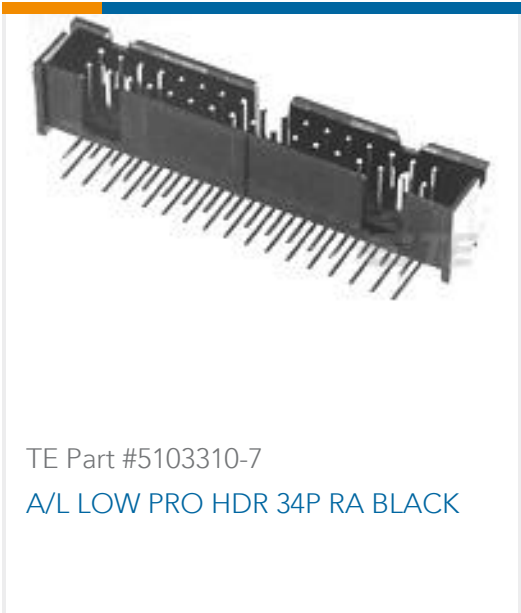
TE Part #5103310-7 A/L LOW PRO HDR 34P RA BLACK