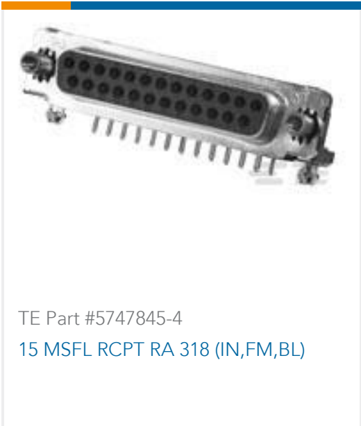
TE Part #5747845-4 15 MSFL RCPT RA 318 (IN,FM,BL)