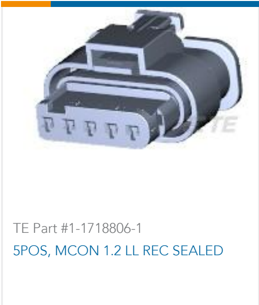
TE Part #1-1718806-1 5POS, MCON 1.2 LL REC SEALED