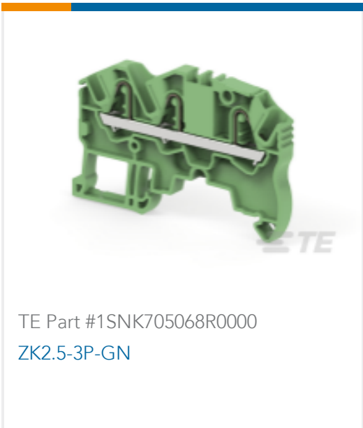
TE Part #1SNK705068R0000 ZK2.5-3P-GN

Assembly, Vertical TH Header, 2-Position