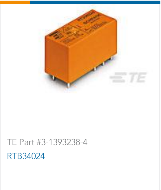
TE Part #3-1393238-4 RTB34024