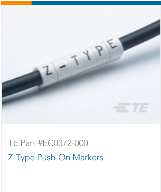
TE Part #EC0372-000 Z-Type Push-On Markers