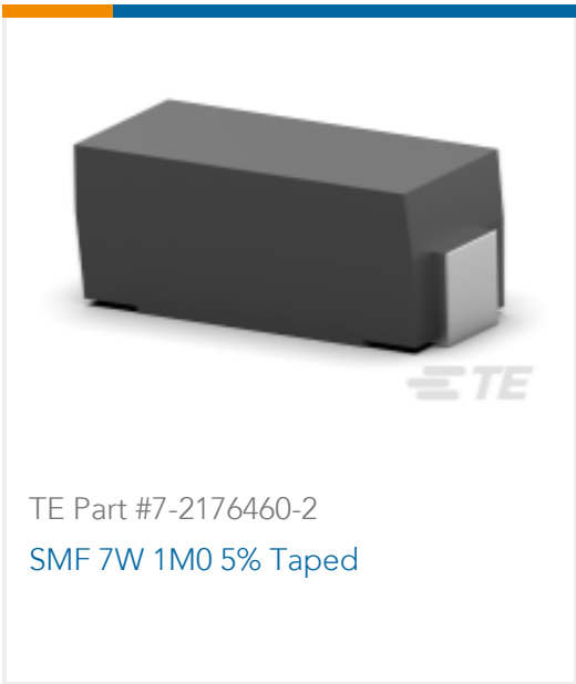
TE Part #7-2176460-2 SMF 7W 1M0 5% Taped