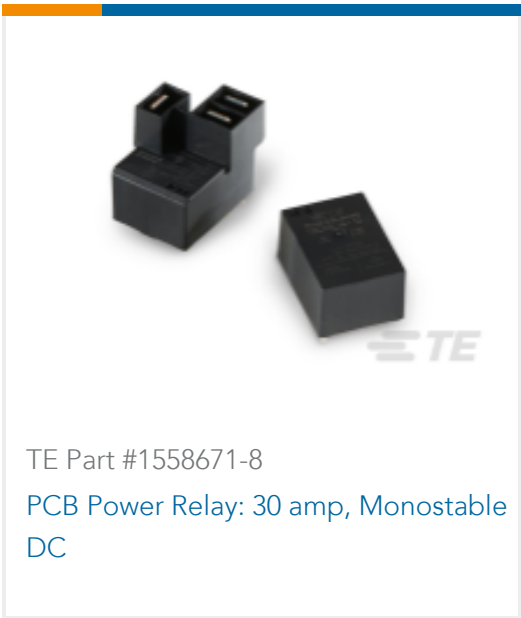
TE Part #1558671-8 PCB Power Relay: 30 amp, Monostable DC