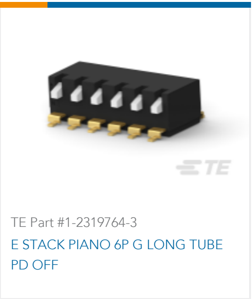
TE Part #1-2319764-3 E STACK PIANO 6P G LONG TUBE PD OFF