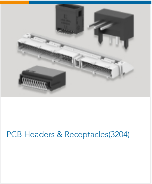
PCB Headers & Receptacles(3204)