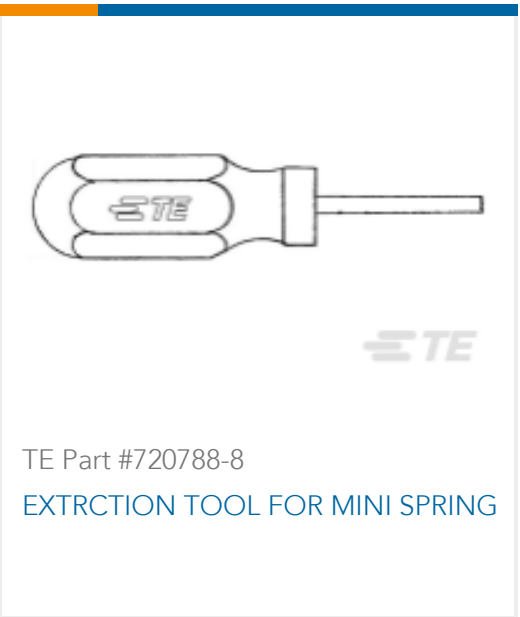
TE Part #720788-8 EXTRCTION TOOL FOR MINI SPRING