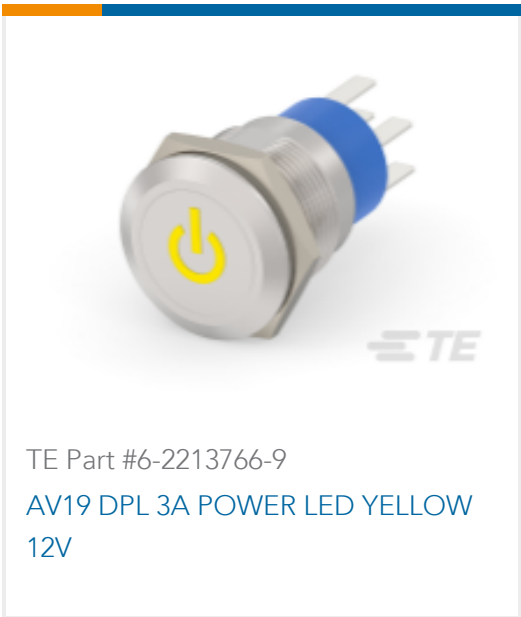
TE Part #6-2213766-9 AV19 DPL 3A POWER LED YELLOW 12V