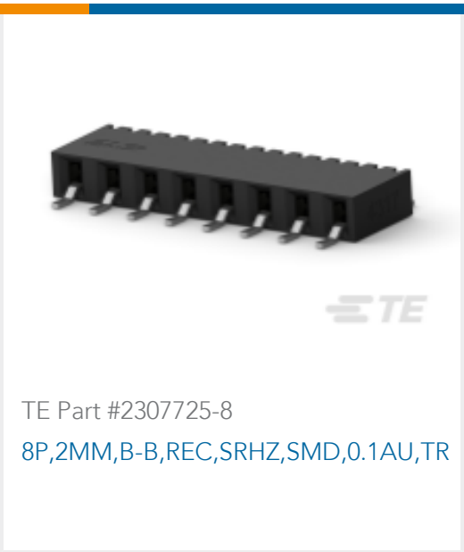
TE Part #2307725-8 8P,2MM,B-B,REC,SRHZ,SMD,0.1AU,TR