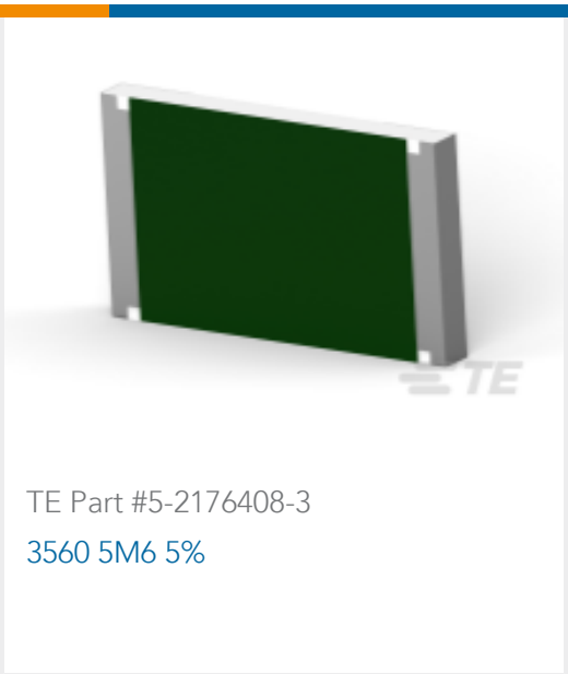
TE Part #5-2176408-3 3560 5M6 5%