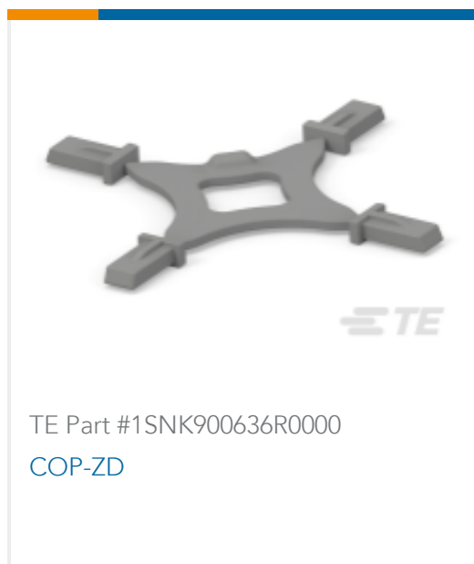
TE Part #1SNK900636R0000 COP-ZD