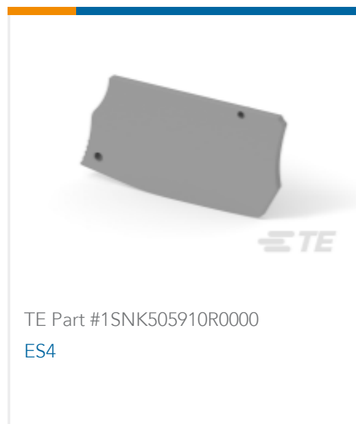
TE Part #1SNK505910R0000 ES4