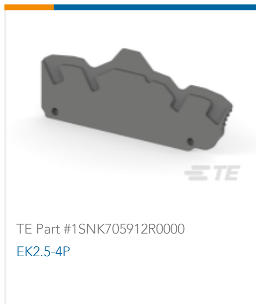
TE Part #1SNK705912R0000 EK2.5-4P