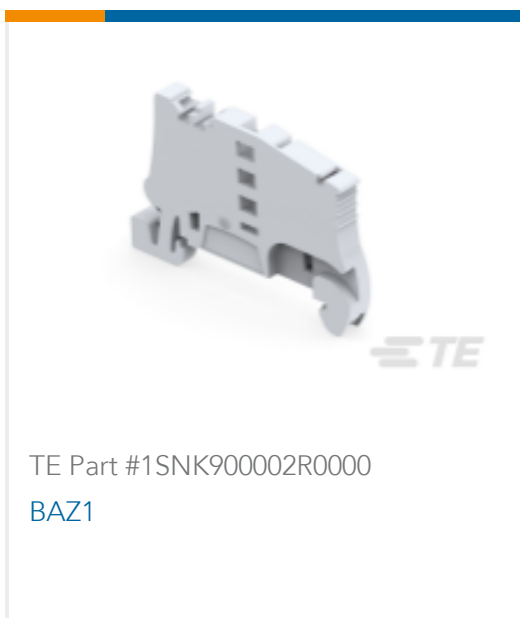
TE Part #1SNK900002R0000 BAZ1