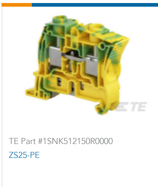
TE Part #1SNK512150R0000 ZS25-PE