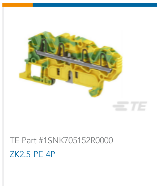
TE Part #1SNK705152R0000 ZK2.5-PE-4P