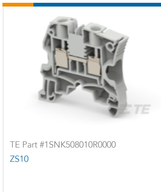
TE Part #1SNK508010R0000 ZS10