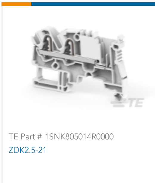
TE Part # 1SNK805014R0000 ZDK2.5-21