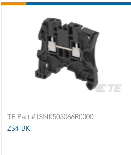
TE Part #1SNK505066R0000 ZS4-BK