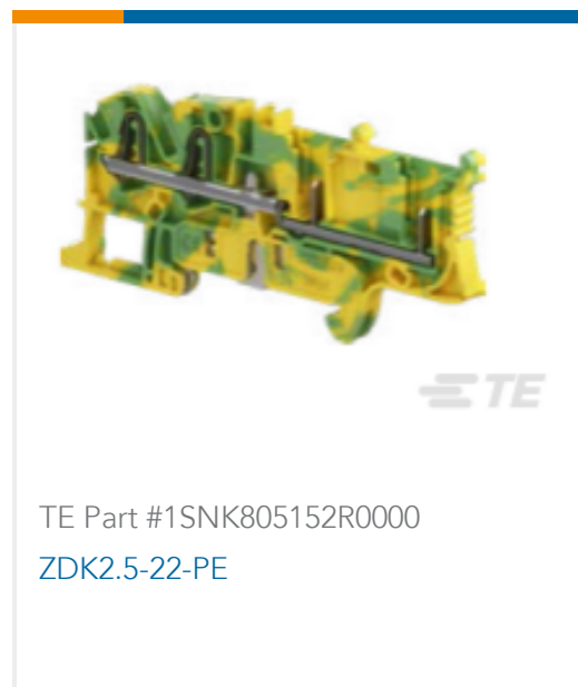
TE Part #1SNK805152R0000 ZDK2.5-22-PE