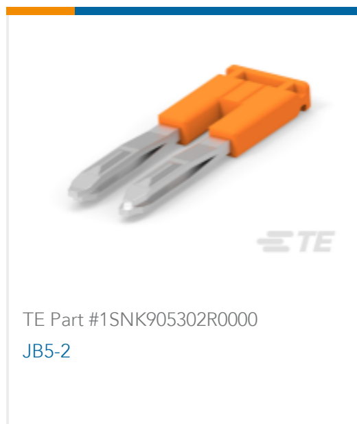
TE Part #1SNK905302R0000 JB5-2