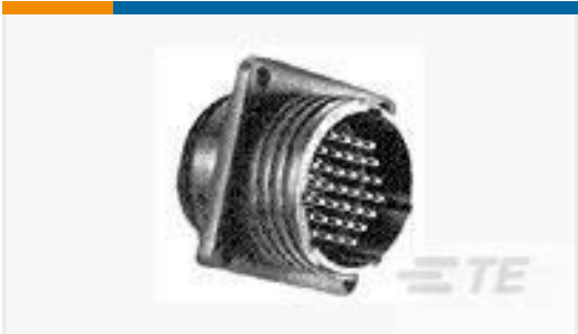
TE Part #182920-1 CPC SQ FL. RCPT REV SEX