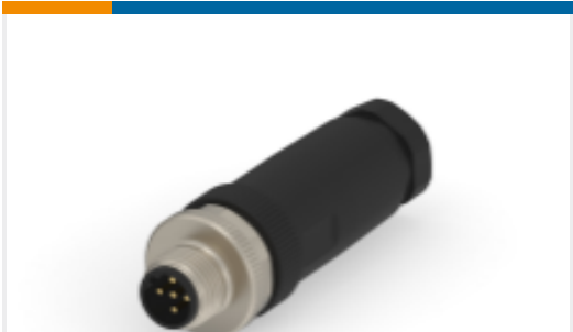
TE Part #T4111402051-000 M12,MALE,STRAIGHT,B CODE,5P, PG9,GOLD