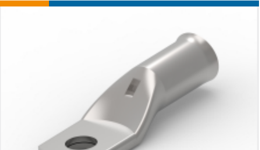
TE Part #710030-8 XCT 16-12