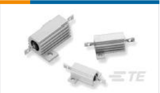
TE Part #1879363-6 THS75 10R 5%