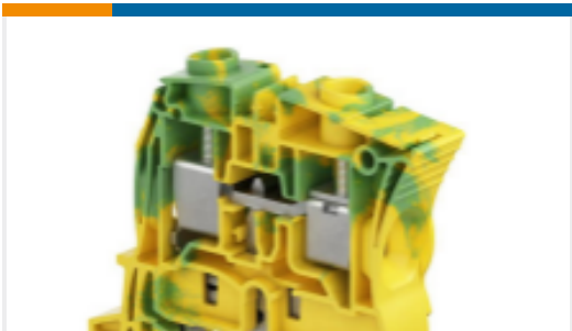
TE Part #1SNK512150R0000 ZS25-PE