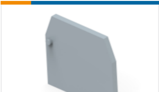
TE Part #1SNA118368R1600 FEM6