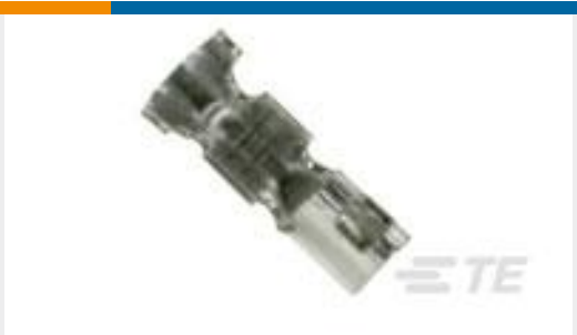
TE Part #179227-1 CRIMP TYPE II REC CONTACT