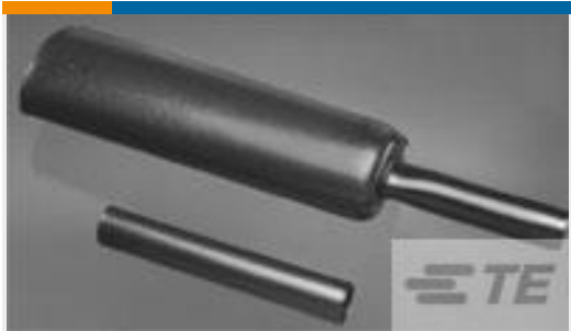
TE Part #E52178-000 RMW-85/25-1200/ADH-0

chromium, mercury, PBB, PBDE, DBP, BBP, DEHP, DIBP, and 0.01% for cadmium, or qualify for an exemption to these limits as defined in the Annexes of Directive 2011/65/EU (RoHS2). Finished electrical and electronic equipment products will be CE marked as required by Directive 2011/65/EU. Components may not be CE marked. Additionally, the part numbers that TE has identified as EU ELV compliant have a maximum concentration of 0.1% by weight in homogenous materials for lead, hexavalent chromium, and mercury, and 0.01% for cadmium, or qualify for an exemption to these limits as defined in the Annexes of Directive 2000/53/EC (ELV). Regarding the REACH Regulation, the information TE provides on SVHC in articles for this part number is based on the latest European Chemicals Agency (ECHA) 'Guidance on requirements for substances in articles' posted at this URL: https://echa.europa.eu/guidance-documents/guidance-on-reach