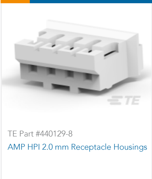
TE Part #440129-8 AMP HPI 2.0 mm Receptacle Housings