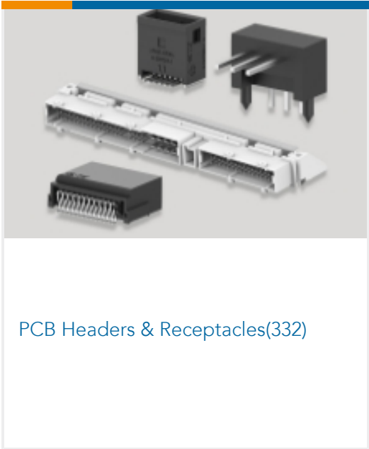
PCB Headers & Receptacles(332)