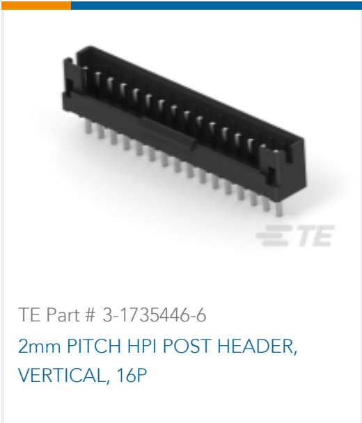
TE Part # 3-1735446-6 2mm PITCH HPI POST HEADER, VERTICAL, 16P