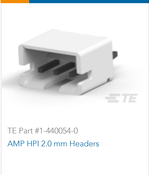
TE Part #1-440054-0 AMP HPI 2.0 mm Headers