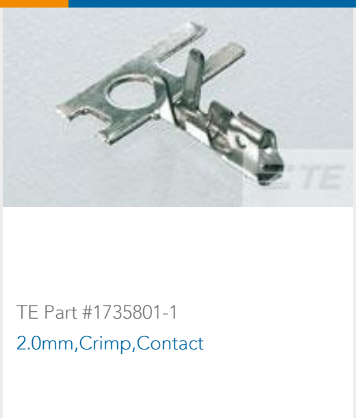
TE Part #1735801-1 2.0mm,Crimp,Contact

2MM PITCH HPI POST HEADER, VERTICAL, 16P