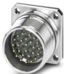
Device connector, rear mounting, M27, type of contact: Pin, Solder-in connection

Please be informed that the data shown in this PDF Document is generated from our Online Catalog. Please find the complete data in the user's documentation. Our General Terms of Use for Downloads are valid ( http://phoenixcontact.com/download )