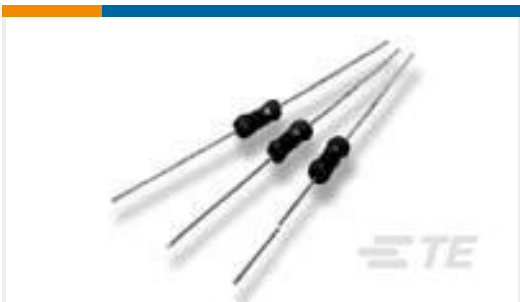
TE Part #5-1625885-2 1W SM M/OX 5% 27R