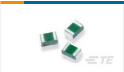
TE Part #1624351-1 NTC0805 5% 20K