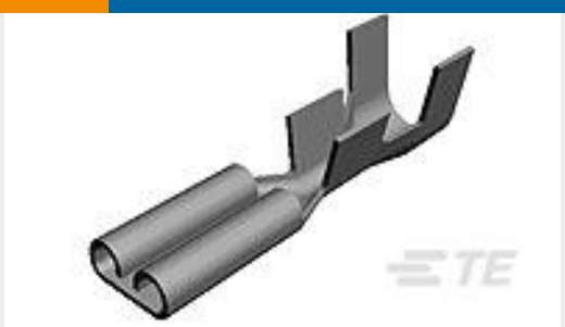
TE Part #42566-2 187 FASTON REC 20-16 AWG TPBR