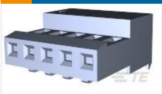
TE Part #3-640443-5 05P MTA100 CONN ASSY GRN