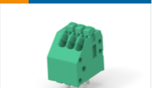
TE Part #1-2834021-3 3POS 2.5MM TES CONN.