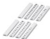
Zack Marker strip, flat, can be ordered: Strip, white, labeled according to customer specifications, Mounting type: Snap into flat marker groove, for terminal block width: 3.5 mm, Lettering field: 3.5 x 5.2 mm

Zack Marker strip, flat - ZBF 3,5 CUS - 0829394