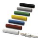
Insulating sleeve, Color: green