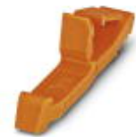
Latching, Color: orange