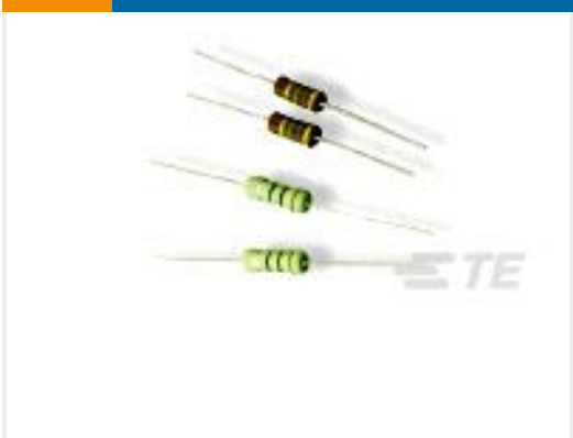
TE Part #1-1623719-3 CCR1 4K7 10%