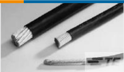
TE Part #0416743001 AFR35-16.0-0