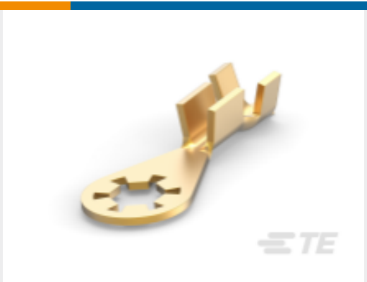
TE Part # 485079-1 RING AMVAR 18-14 IS 8 028 LUBZ