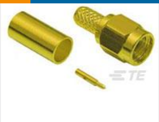
TE Part #1-1478916-0 SMA STR PLG C/CRMP RG174 GSS