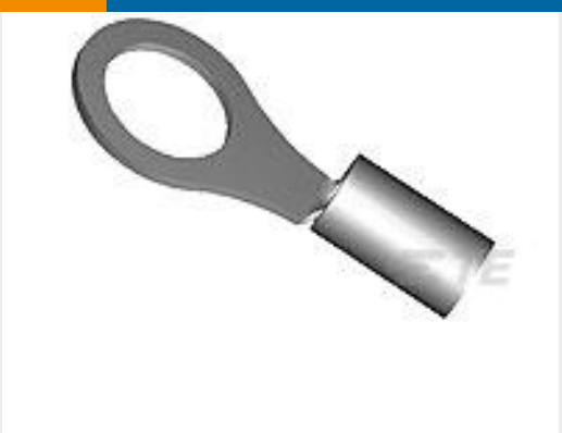
TE Part #323063 TERMINAL,SOLIS R HR 12-10 1/4