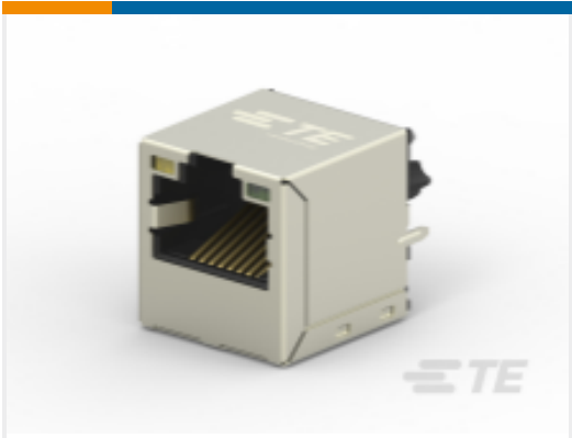
TE Part #2301995-3 RJ45 JACK INT.MAG. 10/100 LED 1X1 VERT.