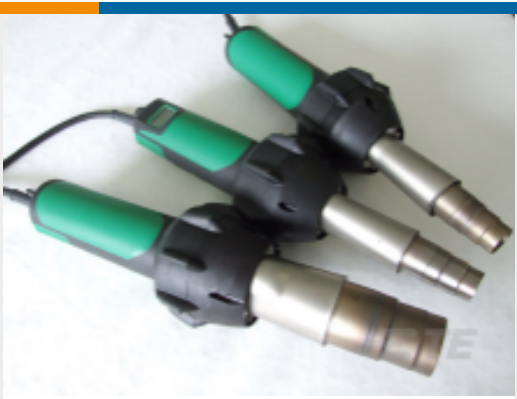
TE Part # EG1114-000 CV1981-ST-230V1600W-EU

on SVHC in articles for this part number is based on the latest European Chemicals Agency (ECHA) ‘Guidance on requirements for substances in articles’ posted at this URL: https://echa.europa.eu/guidance-documents/guidance-on-reach