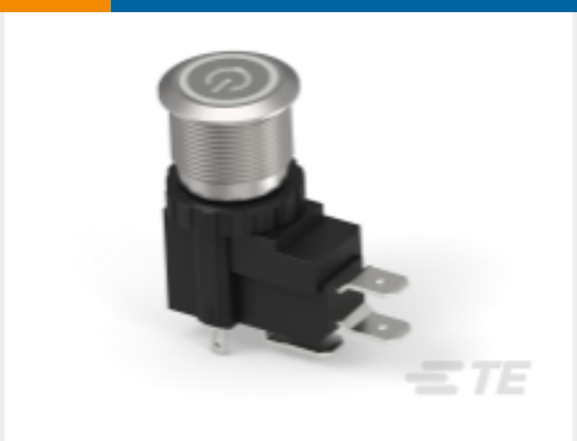
TE Part #2-2364573-0 AVH19 FLT SS LK R+P BLU 24V26A