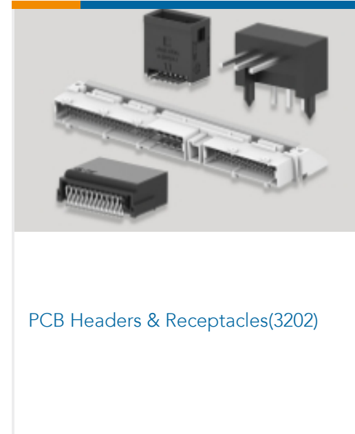
PCB Headers & Receptacles(3202)