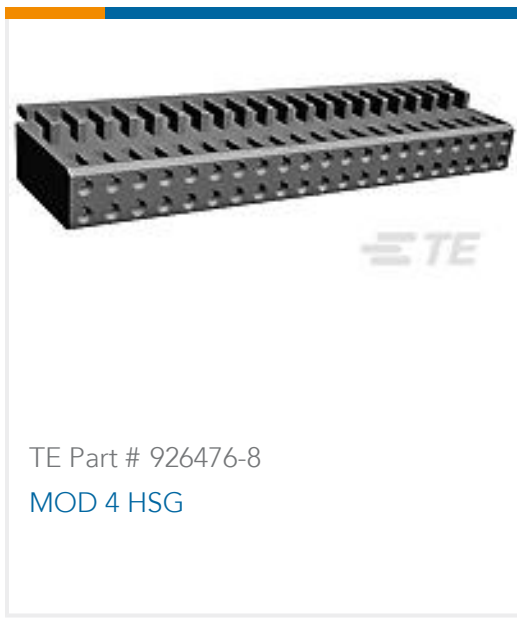
TE Part # 926476-8 MOD 4 HSG