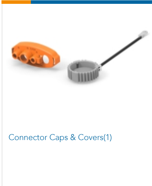
Connector Caps & Covers(1)