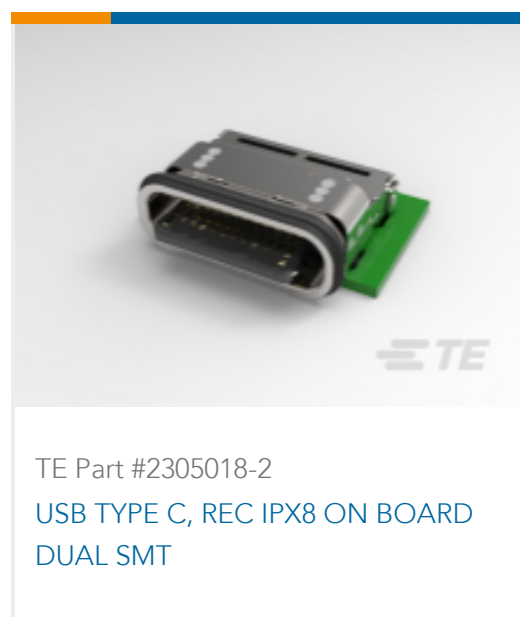
TE Part #2305018-2 USB TYPE C, REC IPX8 ON BOARD DUAL SMT