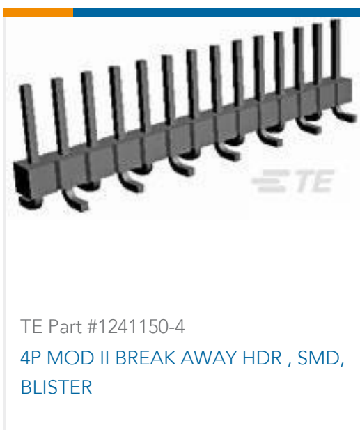
TE Part #1241150-4 4P MOD II BREAK AWAY HDR, SMD, BLISTER