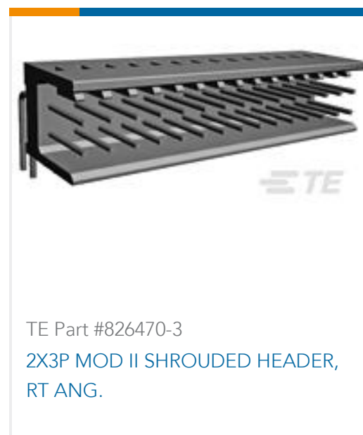
TE Part #826470-3 2X3P MOD II SHROUDED HEADER, RT ANG.