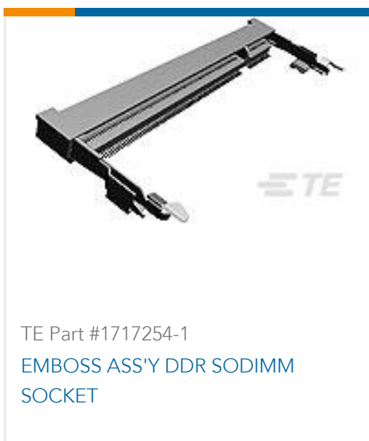
TE Part #1717254-1 EMBOSS ASS'Y DDR SODIMM SOCKET