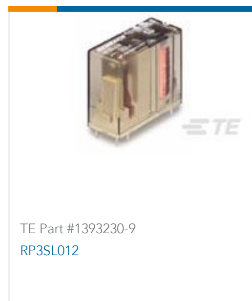
TE Part #1393230-9 RP3SL012