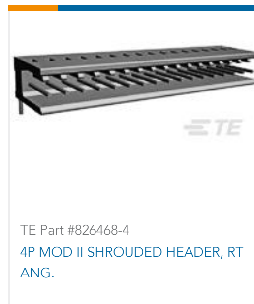
TE Part #826468-4 4P MOD II SHROUDED HEADER, RT ANG.