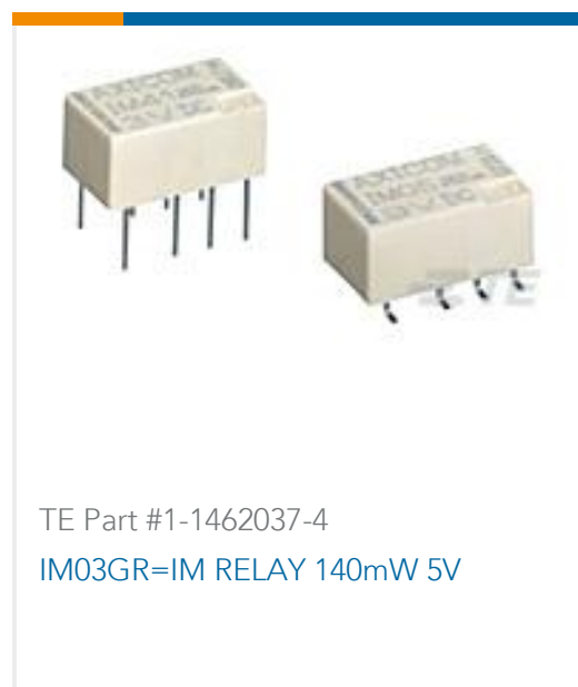
TE Part #1-1462037-4 IM03GR=IM RELAY 140mW 5V