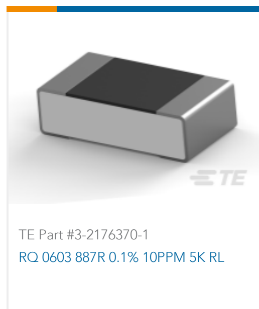
TE Part #3-2176370-1 RQ 0603 887R 0.1% 10PPM 5K RL