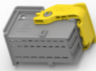
TE Part #1-1718484-2 AMP Carrier for Receptacle Inserts