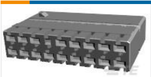
TE Part #1718489-1 AMP MCP 1.5 RECEPT HSG 18 POS