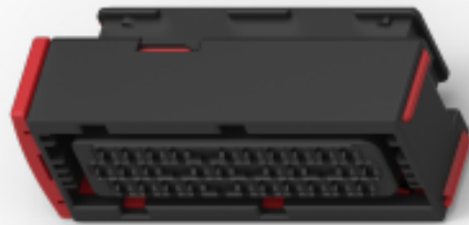
TE Part #1-963223-2 J-P-T GEH KPL 29P