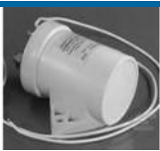
TE Part #6-1618388-7 LEV200H5ANF=RELAY, SPST-NO