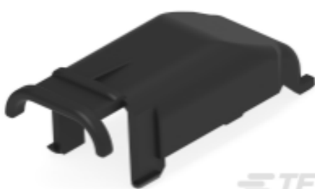
TE Part #368401-1 COVER HSG FOR 40P(SIEMENS)