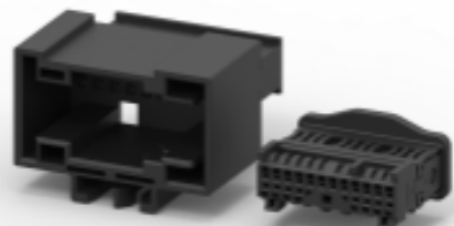
TE Part #368383-1 MQS, CONNECTOR HOUSING