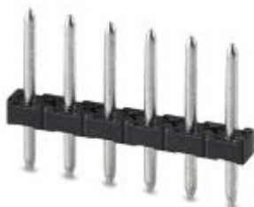
The figure shows a 6-position version

Please be informed that the data shown in this PDF Document is generated from our Online Catalog. Please find the complete data in the user's documentation. Our General Terms of Use for Downloads are valid ( http://phoenixcontact.com/download )