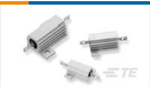
TE Part #1879075-5 THS25 R15 5%