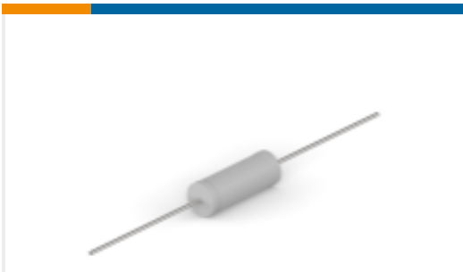
TE Part #3-2176412-0 5W XSM M/OX 5% 82R