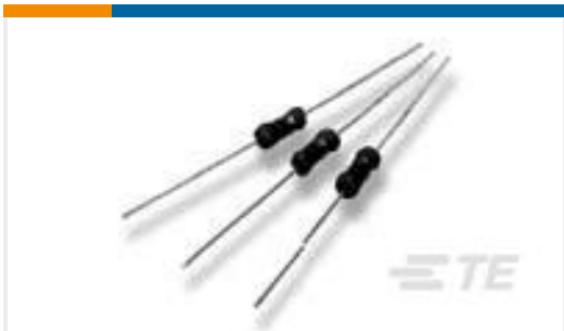
TE Part #8-1879354-7 RR03 5% 1K2 AMMO