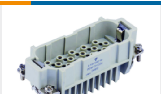
TE Part #T2020802101-000 HD-040-M 41-80