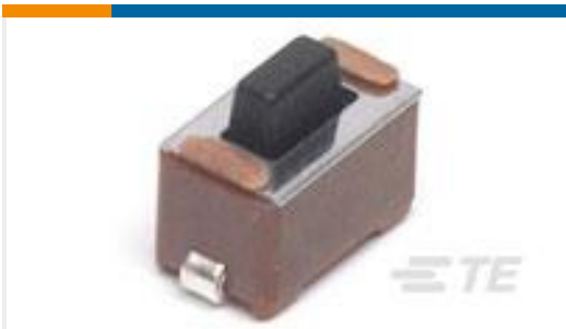
TE Part #1437566-4 FSMSMTR=TACT SWITCH