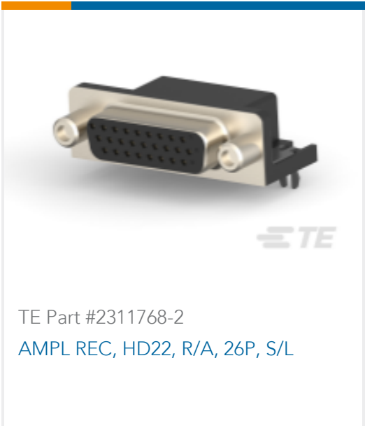
TE Part #2311768-2 AMPL REC, HD22, R/A, 26P, S/L