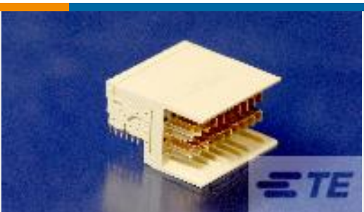
TE Part #6469169-1 HMZD 2PR RA HDR 40P