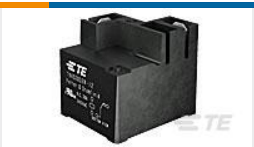
TE Part #2-1393210-0 T9AS1D12-5