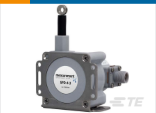
TE Part #SP3-25 STRING POT 25 INCH RANGE