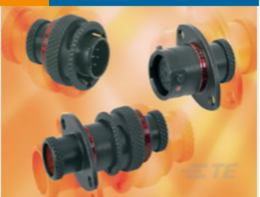
TE Part #ASDD106-09SA-HE INLINE RECEPT ASSY. ASDD 9 WAY.