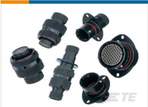
TE Part #ASL606-05PN-HE PLUG ASSY. AS MICRO MK3.