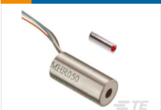
TE Part #02560411-000 LVDT MHR 500 ASSY