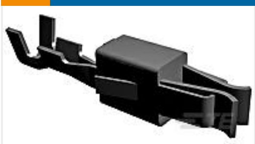
TE Part #1-927770-1 JPT REC 2.8 Contact SWS Au