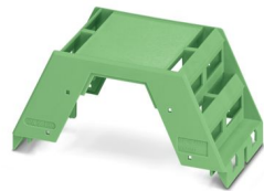
DIN rail housing, Upper housing part for PCB terminal blocks with screw connection, width: 45.2 mm, height: 99 mm, depth: 45.85 mm, color: green (similar RAL 6021)

Please be informed that the data shown in this PDF document is generated from our online catalog. Please find the complete data in the user documentation. Our general terms of use for downloads are valid.