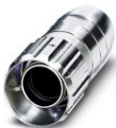
Sleeve housing for cable connector, straight, Bayonet locking, M23, shielded: yes

Please be informed that the data shown in this PDF Document is generated from our Online Catalog. Please find the complete data in the user's documentation. Our General Terms of Use for Downloads are valid ( http://phoenixcontact.com/download )