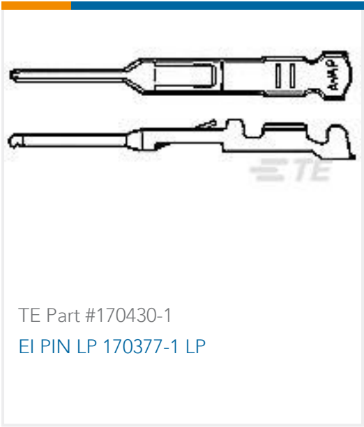
TE Part #170430-1 EI PIN LP 170377-1 LP