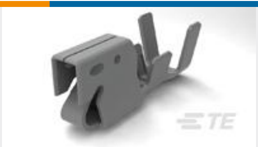
TE Part #1744144-1 EP-II CONTACT LANCELESS, 22-18