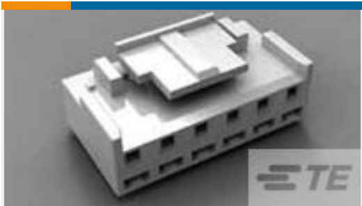
TE Part #1-1123722-2 3.96 EP PLUG HSG 2P(NATURAL)