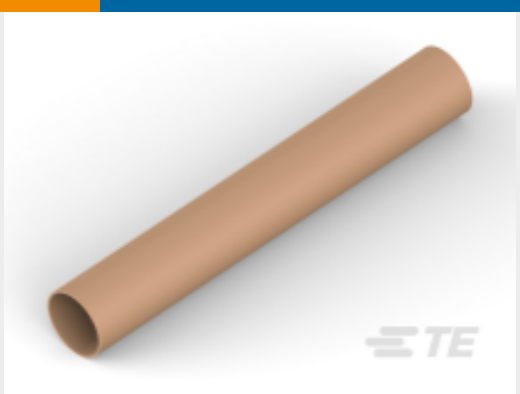
TE Part #8509970001 SAS-115-1-1017-1X