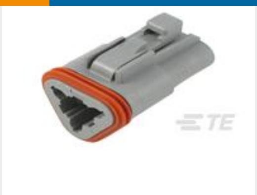
TE Part #DT06-3S PLG, 3P, GRY, N