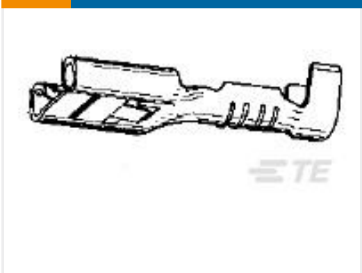
TE Part #280755-4 FF 375 REC 6-10MM2 TPPB