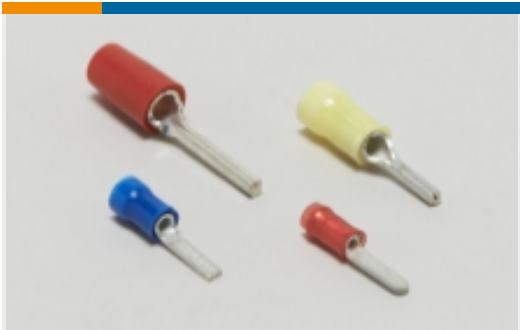
Crimp Wire Pins, Tabs & Ferrules(1)