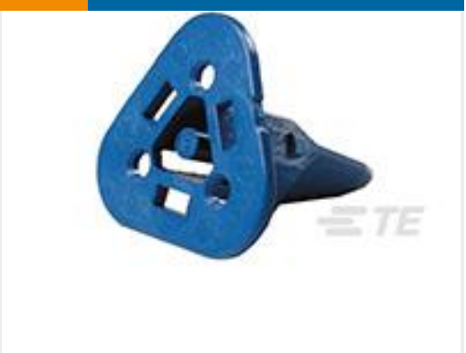
TE Part #W3S-1939 WEDGE LOCK, 3P, PLG, BLU, STD, J1939, DT