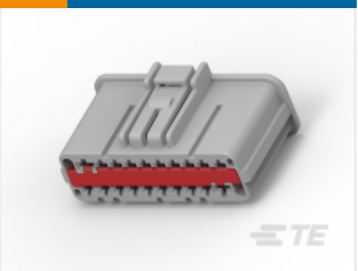
TE Part #2098377-2 20P PLUG ASSEMBLY UNSEALED HYBRID B-KEY