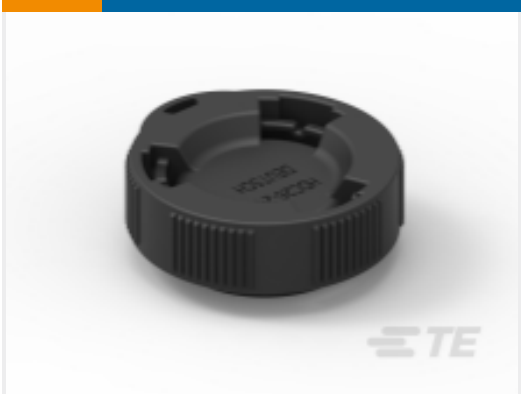
TE Part #HDC26-24 DUST CAP, 24SZ, REC, BLK, HDP