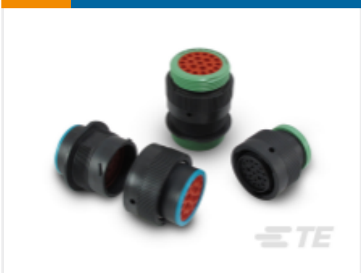
TE Part #HDP24-24-23SE DEUTSCH HDP20 Housings