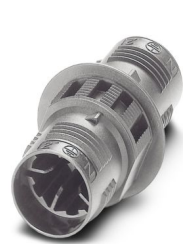
QUICKON cable connector, gray, 4+PE-pos., 1.0 mm 2 ... 2.5 mm 2 / 690 V / 20 A, for 9 mm ... 16 mm cable diameter.

Please be informed that the data shown in this PDF document is generated from our online catalog. Please find the complete data in the user documentation. Our general terms of use for downloads are valid.