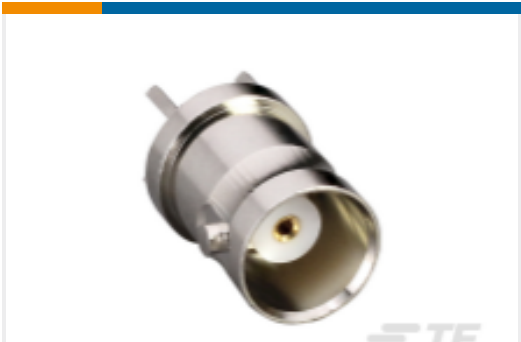
TE Part #CONBNC001 BNC Jack 50 Ohm PCB Through Hole