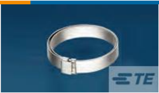
TE Part #CW2822-000 R85049/128-1