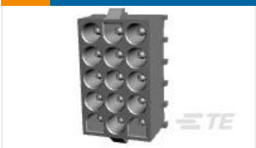
TE Part #350434-1 15P UMNL PIN HDR ASSY NATL