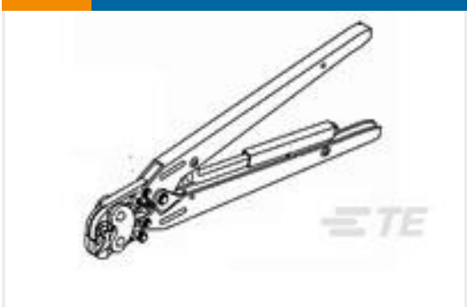
TE Part #1463260-1 DAHT 025 TAB REC G-Tab 22-20 ASSY