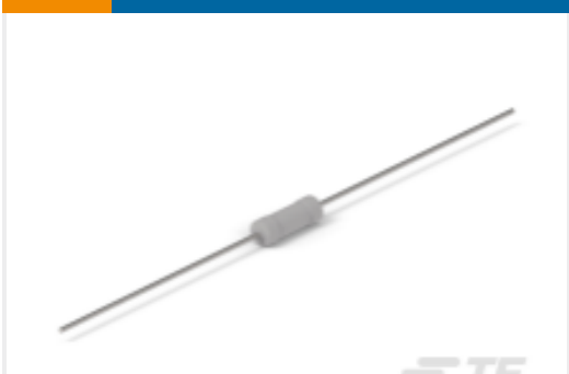
TE Part #6-1676123-9 1/2W SM M/OX 5% 560R