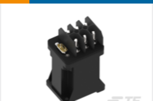
TE Part #5-1617818-0 FCC-360-CU4 =OVERALL_TH