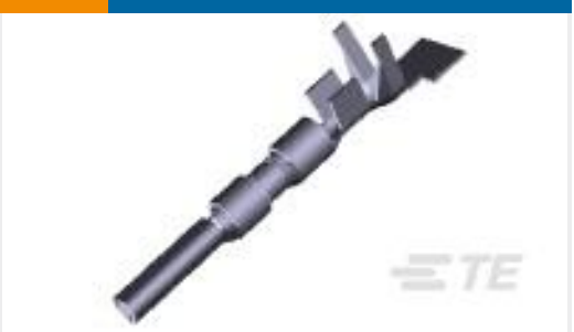
TE Part #794229-1 MINI UMNL2 SOK 22-18 AWG SN LP