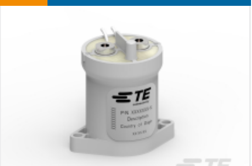
TE Part #2138602-1 RELAY,EVC135,24 VDC COIL,165mm WIRE