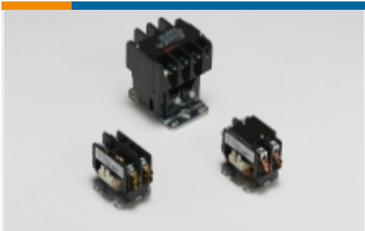
Definite Purpose Contactors(4)