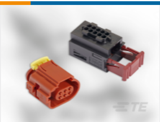
TE Part #929505-7 Timer Connector Housing