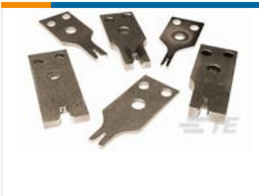
TE Part #5-1490019-8 CRIMPER, WIRE (.075" 'F')