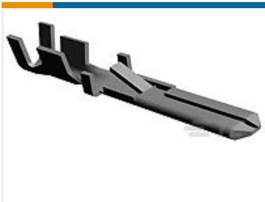
TE Part #928931-2 FF 110 (2.8 X 0.8 MM) TAB PTP CUZN30