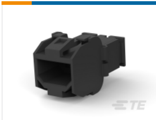
TE Part #928193-1 FF 2.8MM TAB HSG 2P PBT BLACK