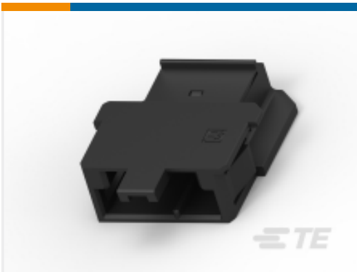
TE Part #1-968977-9 2,8MM FLA-STE-GEH3P