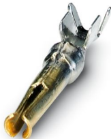
Crimp contact, Socket, rolled, Taped product, contact diameter: 1 mm, Single contact, Item is lead-free in accordance with RoHS II without Exemption 6c (Pb < 0.1 %)

Please be informed that the data shown in this PDF document is generated from our online catalog. Please find the complete data in the user documentation. Our general terms of use for downloads are valid.