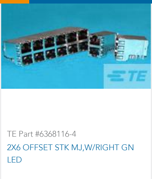
TE Part #6368116-4 2X6 OFFSET STK MJ,W/RIGHT GN LED