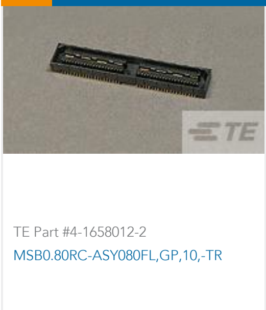
TE Part #4-1658012-2 MSB0.80RC-ASY080FL,GP,10,-TR