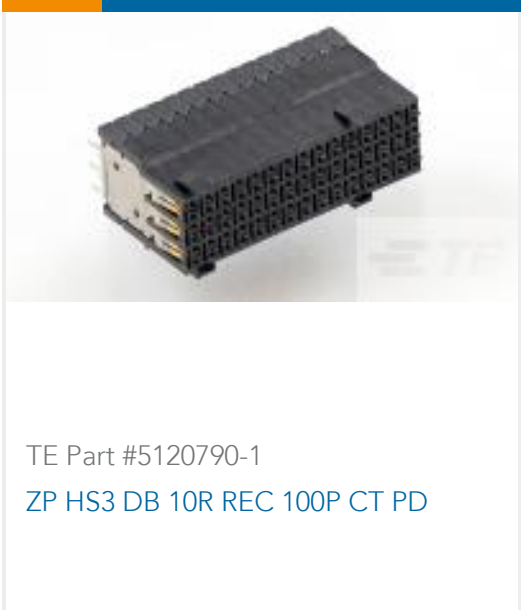
TE Part #5120790-1 ZP HS3 DB 10R REC 100P CT PD