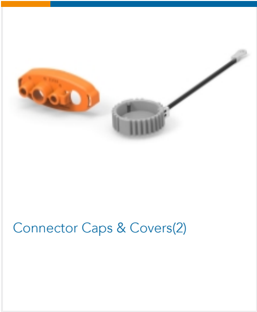
Connector Caps & Covers(2)