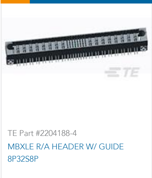
TE Part #2204188-4 MBXLE R/A HEADER W/ GUIDE 8P32S8P