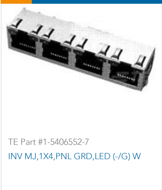
TE Part #1-5406552-7 INV MJ,1X4,PNL GRD,LED (-/G) W