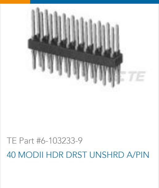
TE Part #6-103233-9 40 MODII HDR DRST UNSHRD A/PIN LED