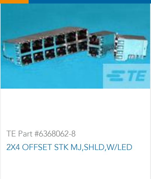
TE Part #6368062-8 2X4 OFFSET STK MJ,SHLD,W/LED