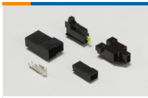
Magnet Wire Terminals(192)