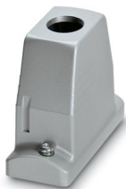
HEAVYCON ADVANCE EMC sleeve housing B16, with screw locking, height 100 mm, with 1xM40 support, and straight cable outlet

Please be informed that the data shown in this PDF document is generated from our online catalog. Please find the complete data in the user documentation. Our general terms of use for downloads are valid.