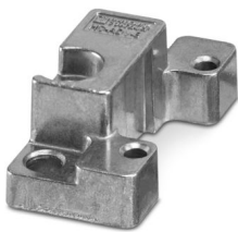
Panel-mount flange for HEAVYCON ADVANCE housing

https://www.phoenixcontact.com/us/products/1686533