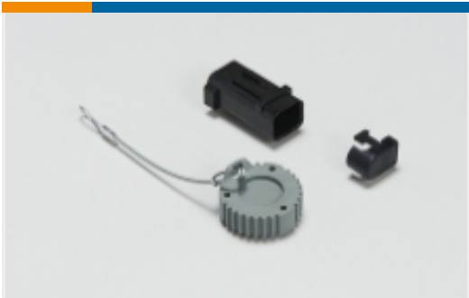
Automotive Connector Caps & Covers (17)