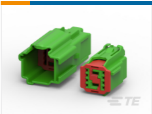
TE Part #1456985-3 GET .64 CONNECTOR SYSTEM, CONNECTOR HSG