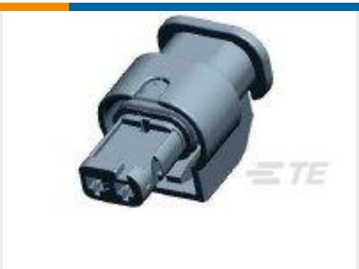
TE Part #1-1670915-1 2POS, MCON 1.2 LL REC SEALED