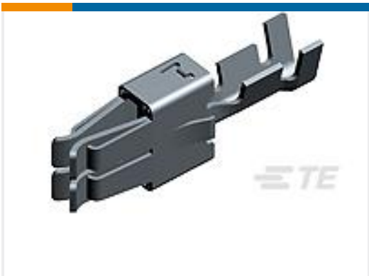
TE Part #964328-1 SPT A REC 6.3 Contact SRC Sn