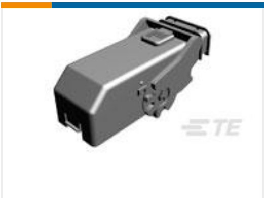
TE Part #1452389-1 COVER ASSY 96 POS.