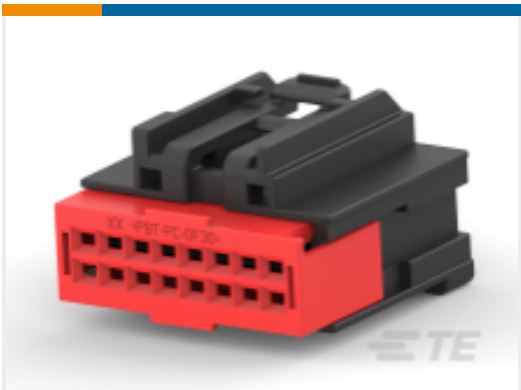
TE Part #1456989-1 2x8 Fem unsealed LP assy Key A