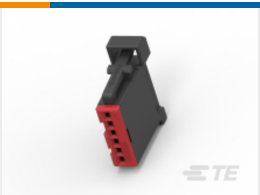
TE Part #2272431-3 1X6 GET UNSLD SIDE LATCH PLUG, KEY C