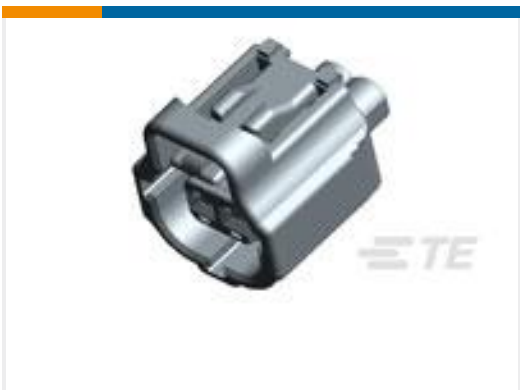
TE Part #184207-1 2 POS. PLUG ASSY, KEY J