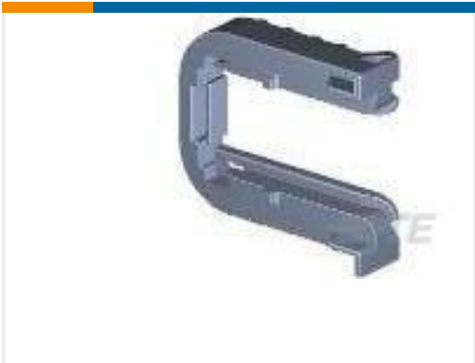
TE Part #1564562-5 SLIDE,TAB HSG GROUP D