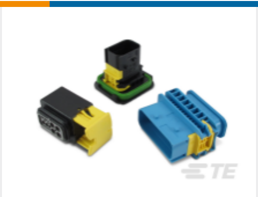
TE Part #1-1564330-1 Heavy Duty Sealed Connector Series Housings