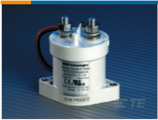
TE Part # 1618002-7 EV200AAANA=RELAY, EV200 SPST-N