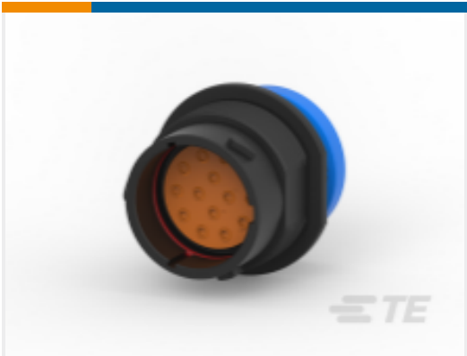
TE Part #HDP24-18-14PE-L017 REC, 14P, BLK, E, RNG, 16, P