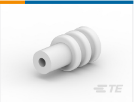
TE Part #1394132-1 BLINDSTOPFEN F.D3,6