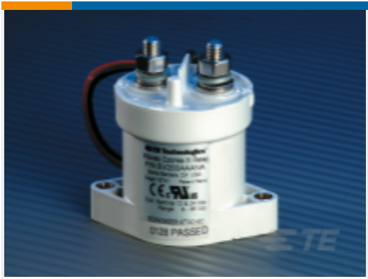
TE Part # 8-1618404-5 EV200DAANA=CONTACTOR, SPST-NC