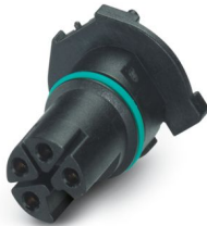
Contact carrier, Power, 4-position, Socket, straight, M12, coding: L, PCB mounting, THR solder connection

Please be informed that the data shown in this PDF document is generated from our online catalog. Please find the complete data in the user documentation. Our general terms of use for downloads are valid.