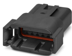
Connector housing, Crimp contacts

Please be informed that the data shown in this PDF document is generated from our online catalog. Please find the complete data in the user documentation. Our general terms of use for downloads are valid.