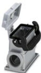
Box mounting base, with single locking latch, height: 74 mm, with 1 x M25 gland, with protective cover

Please be informed that the data shown in this PDF Document is generated from our Online Catalog. Please find the complete data in the user's documentation. Our General Terms of Use for Downloads are valid ( http://phoenixcontact.com/download )