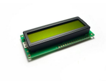
LCD 16*2 Characters - Green Yellow back light