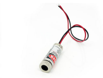
5mW Laser Module emitter - Red Point