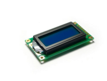
LCD 8*2 Characters - Blue back light