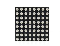
8x8 RGB LED Dot Matrix - Compatible with Rainbowduino...