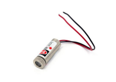
5mW Laser Module emitter - Red Line