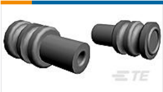
TE Part #2112323-1 SINGLE WIRE SEAL,MT 2,VT