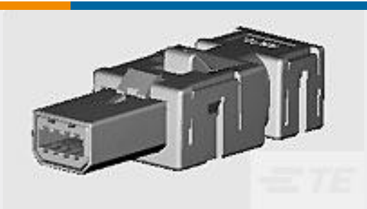
TE Part #2069578-1 MINI I/O PLUG CONN KIT(100 PC) D-2