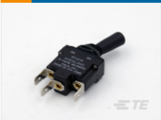
TE Part #K1002975 Toggle Switch 07-1-2-13