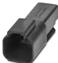
Connector housing, Crimp contacts

https://www.phoenixcontact.com/us/products/1520946