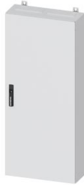
ALPHA 400, wall-mounted cabinet, Flush-mounting, IP31, type of protection 1, H: 1250 mm, W: 550 mm, T: 210 mm, RAL 9016